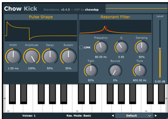
Figure 1: ChowKick User Interface

To install ChowKick, download the latest release , and run the installer. If you would like to try the latest builds (potentially unstable), visit the Nightly Builds page . Note that it is also possible to compile from the source code .